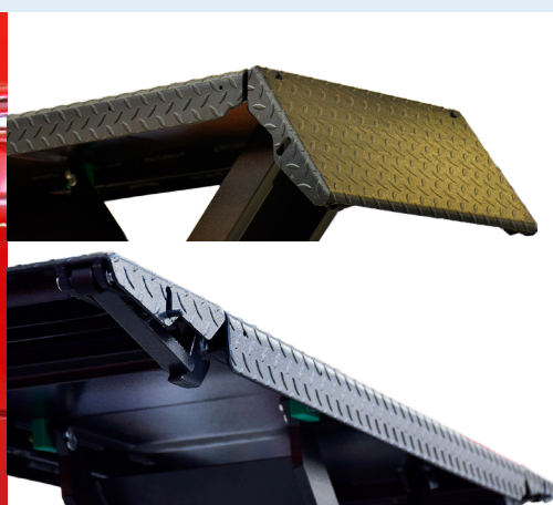
Adjustable ramps with flaps: Easy to lock and unlock with one hand