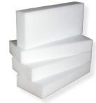
Crush blocks 2"x6"x13" (included)