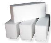
Crush blocks 4"x6"x13" (included)