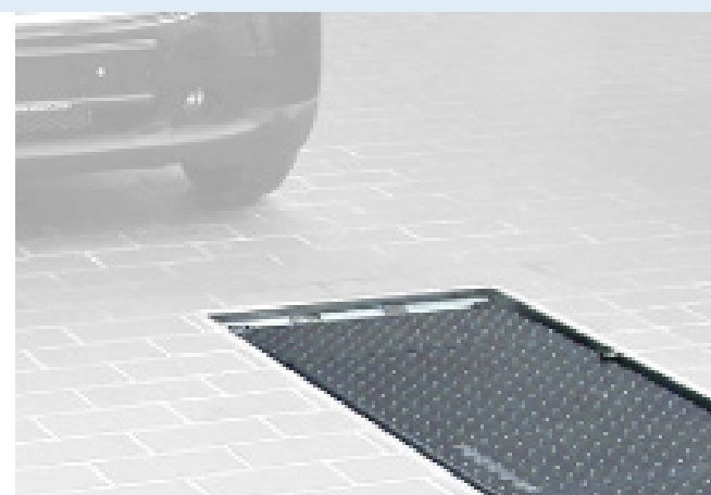
In-ground or above ground installation