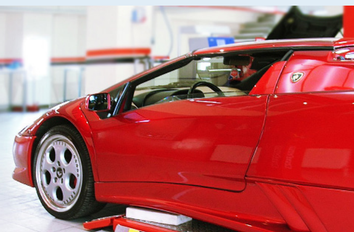
Very low construction: perfect for sports cars