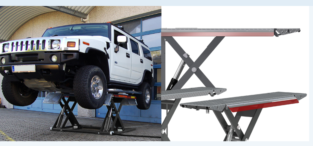
Flaps to increase the length of the ramps from 55" to 79", easy to lock and unlock with one hand